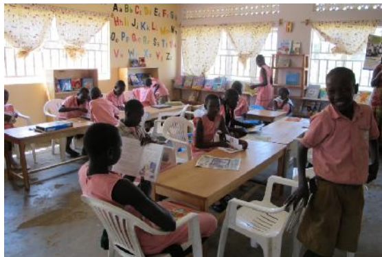
Soroti Children's Library